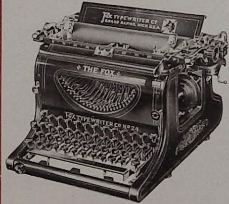
Model No. 24