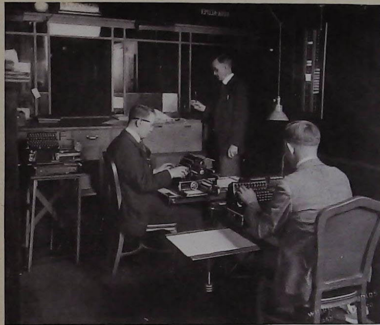
Posting Guests' Accounts, St. Francis Hotel

I m Th va to ba fo th jo m th ne nu wi de ge pr E