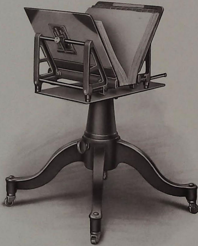
BINDER RACK AND STAND

All accounts always in balance, statement always ready to mail, proven balance always waiting to be taken off