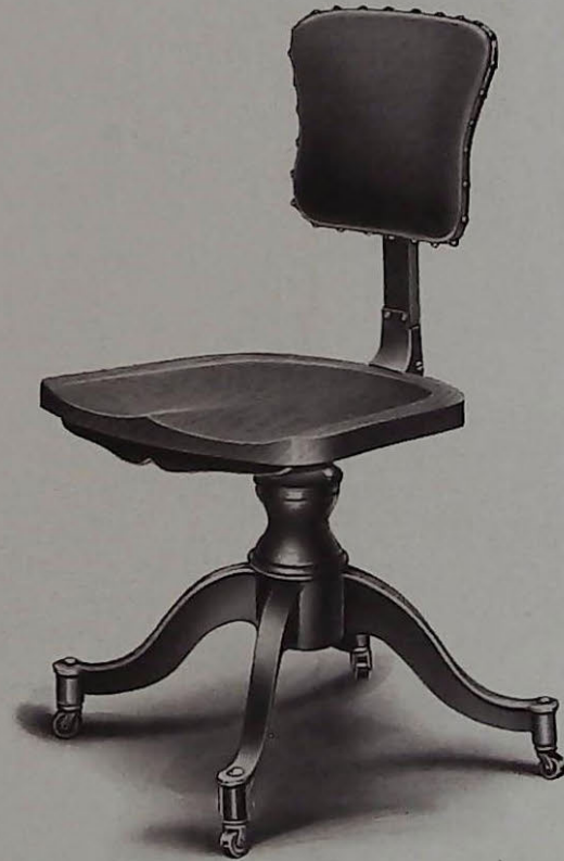
ELLIOTT-FISHER BOOKKEEPER'S CHAIR

Elliott-Fisher The Bookkeeping Machine will turn the nightmare of mistake, worry and delay into daytime efficiency in your bookkeeping department and you can get